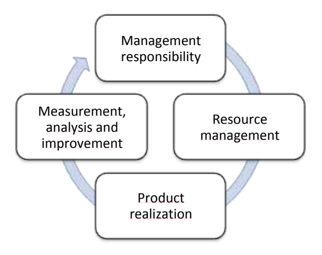
Figure 1. Quality system fundation.